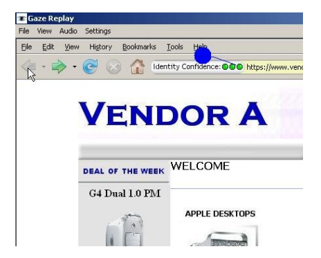
Fig. 3. A screenshot of the eye tracker replay function. The large circle near the identity confidence indicator shows the participant's fixation on that region of the screen.

One of the more interesting findings in the eye tracking data was how long users spent gazing at the content of the web pages as opposed to gazing at the browser chrome. On average, the 15 participants who gazed at traditional indicators, new identity indicators, or both, spent about 8.75% of time gazing at any part of the browser chrome. The remaining 13 participants who did not gaze at indicators spent only 3.5% of their time focusing on browser chrome as opposed to content. These percentages may have been even lower had the tasks involved in the study taken longer to complete. While other studies have found that many users are unable to distinguish between web page content and chrome, ours suggests they do distinguish between the two and that they rarely glance at the chrome at all. This finding was also supported by the participants' comments during the follow-up interview. When the identity indicators were pointed out to participants, many made comments such as "I didn't even think to look up there" or "I was only focusing on the web page itself."